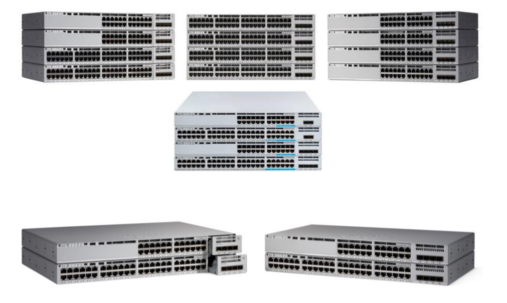
Figure 1. Cisco Catalyst 9200 Series switches

The Cisco Catalyst 9200 Series is made up of modular (C9200) and fixed (C9200L) switch models.